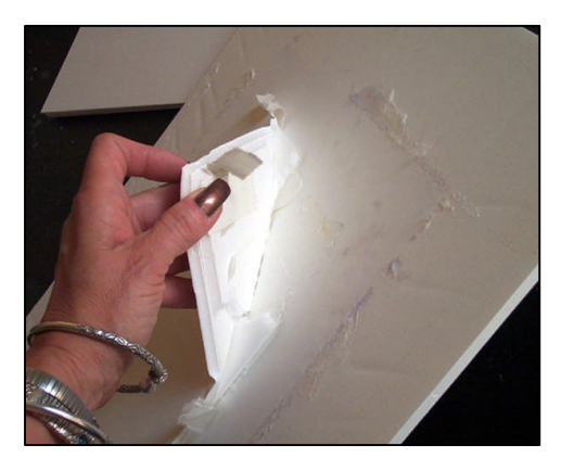
photo 3 Hot glue was used to bond the float panel to the backing and was inseparable, massive Tpeel strength.

The cast paper Iris image had been properly Japanese hinged using cooked starch paste to a reverse bevel cut center panel. That floated panel was hot glued to the white rag board behind it. Not only did the hot glue pass the "90 degree peel" test, it was nearly impossible to remove from the backing at all (photo 3 and 4) . Reversible...I think not.