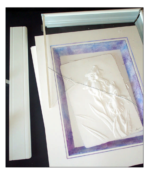
photo 1 Broken glass, torn hinges and bent metal moulding.

I framed the paper cast image Irises for Hunt Corporation in 1995 as a traveling show display. During the Atlanta 2002 show this display piece elected to leap from the wall one lonely night and crash to the floor. Since I was the original framer Hunt asked me to repair and replace the damaged portions of the image for future use (photo 1) . It is always interesting when the opportunity arises to open up a frame that had been prepared for aggressive show travel to see how well it has faired over the years at the hands of UPS and assorted freight lines.