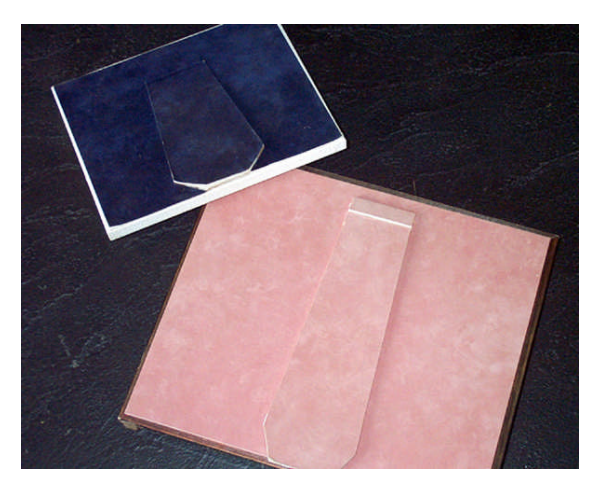
photo 6 They were backed with suede mat self-standing easel backs that needed to be replaced also.