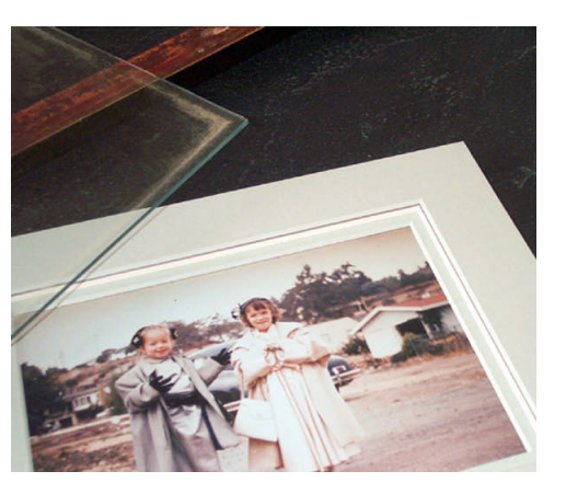
photo 8 No interior damage or reaction. All mats and the photo remained lightfast.

The easel back had been attached to the dust cover beneath it using ATG tape, which was also bonded with ATG to the moulding. The bond was still very aggressive. The longevity of a pressure-sensitive tape is only as good as the process of its application. Too often p-s tapes are not burnished into place, hence the adhesive may only have been activated 50%. These tapes had been twice burnished, once for the dust cover, again with the easel back...this ATG was really stuck.