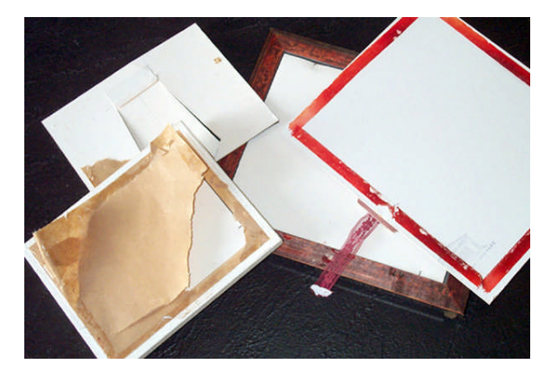
photo 7 The tape beneath the suede easel, between dust cover and easel had turned bright red.

Having just dismantled the above Iris piece for repair, p-s adhesive tapes remained on my mind. As the two photos were dismantled the bond of the ATG tape holding the suede easels and backing paper to the mouldings was carefully examined. The tape on the larger piece had reacted with the stain and wood of the lacquered moulding and had tuned a bright red (photo 7) . Regardless of the chemical changes that had been occurring there was no visible change or damage inside.