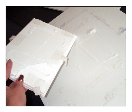
photo 4 It required the base to be peeled from the float with a sharpened bamboo knife.

Looking further into the frame there was no detectable visible damage or chemical reaction to the hot glue. The lasting bond of the 3M #3797 neutral pH hot glue stood solid. Though the nature of hot glue permanence may be generally frowned upon for use in a frame, there are situations where it may be applied with no damage. This traveling floated cast paper image makes a good case for that.