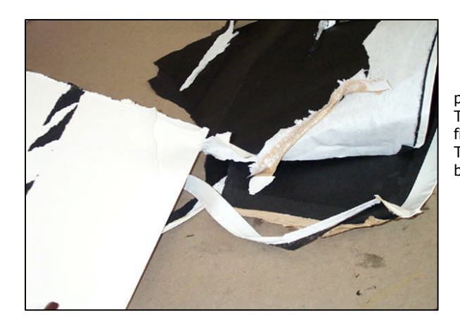
photo 2 The pressure-sensitive Velcro and linen tapes used to help seal the filler boards to the metal frame edges was still extremely aggressive. The linen carrier had dried out and the adhesive had peeled from it, but the saturation and bond remained aggressive to the paper and metal.