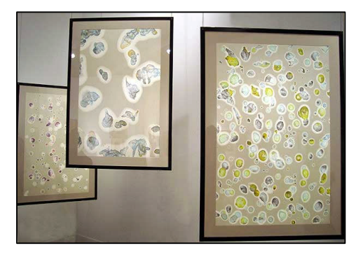
photo 1 This encaustic monoprint is housed in a translucent acrylic frame unit hung suspended by cables in the center of the gallery to allow light to penetrate through.

A few years ago a friend of mine Paula Roland, encaustic artist from Santa Fe, NM had a series of full sheet sheer monoprints that she wanted light to be able to transfuse through for exhibition. She also wanted the framing to be preservation. She and her framer came up with an inventive way to present her pieces in a preservation way while still maintaining the translucent look allowing light to reflect through (photo 1) . The framed art is displayed as a free hanging panel suspended from the ceiling in the middle of the gallery. She preferred using natural light rather than housing LED lighting and preferred the frame to become more virtual than a visible part of the presentation.