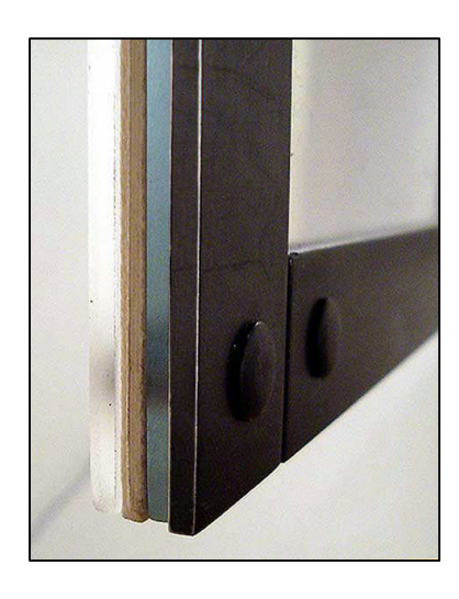
photo 2 The art is between recto-verso mats, backed with frosted white acrylic, topped with clear acrylic and held together by 1/8" thick metal strips bolted at the corners.

By using double mats, air is allowed to circulate between the acrylic and the art preventing sticking or condensation. Also the cotton rag 8-ply mats help protect and seal the enclosure to better protect the art from pollution and ozone damage. END