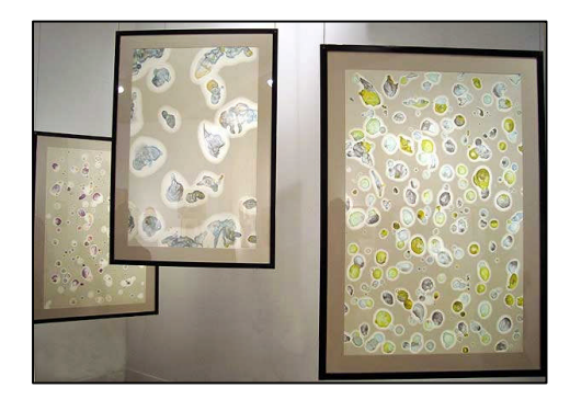
photo 1 This encaustic monoprint is housed in a translucent acrylic frame unit hung suspended by cables in the center of the gallery to allow light to penetrate through.

A few years ago Paula Roland had a stunning monoprint trio on display at the Montserrat Encaustic Conference which as a framer I could not pass up. Those of you who attended will remember them suspended from the ceiling and beautifully backlit allowing the light to pass through the translucent originals (photo 1) . She and her framer came up with an inventive preservation way to present her pieces while maintaining the translucency allowing light to reflect through them. She wanted to use natural light, rather than housing LED lighting within, and preferred the frame to become more virtual than a visible part of the presentation. They opted for recto-verso mats, acrylic sheets and metal trim.