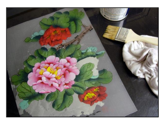
PHOTO 6 WET TO FLATTEN If the paint is traditional glue based water resistant paint it may be totally saturated with water on an acrylic (Plexiglas) covered table top and allowed to dry flat. Wet flattening requires total saturation.

If the paint is traditional glue based Chinese watercolor it may be totally saturated with water and flattened onto an acrylic (Plexiglas) covered table top to dry flat (photo 6) . Wet flattening requires total saturation of the entire painting, not just the crushed portion. In photo 7 notice two things: the fingers at the edge, the dry center portion of the silk. Once soaked the silk will easily wet adhere to the acrylic table and by lightly pulling the silk along all edges with your fingertips it is tightens and flattens against the smooth table to dry.