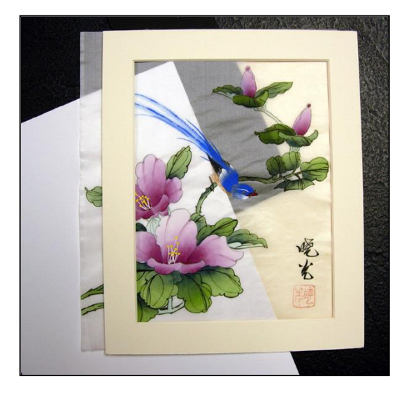
PHOTO 12 COLOR TINTING Selecting a mount board with a color contrast can also color enhance through tinting the over all painting. Black, white and crème are shown in the photo, but blue, pink or green would intensify and yes, change the original painting colors.

In like turn, selecting a mount board of color contrast can also color enhance through tinting the over all painting (photo 12) . Black, white and creme are shown in the photo, but blue, pink or green could intensify and alter the original painting colors and look.