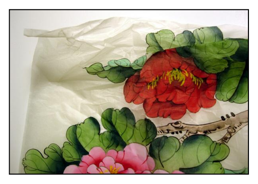
PHOTO 5 CRUMPLED, CRUSHED OR CREASED A badly stored or transported silk painting may become crumpled, crushed or creased. This sampler was deliberately hand crushed. The sizing in the silk allows it to hold a crush like paper.

As much as tourists care for their treasures, accidents happen. A badly stored or transported silk painting may become crumpled, crushed or creased (photo 5) . The sizing and pigments selected in silk paintings is what allows it to hold a crush like paper. Soft fabric might tolerate warm pressing with an iron and cover cloth, but be careful of creating harder creases in sized fabrics.