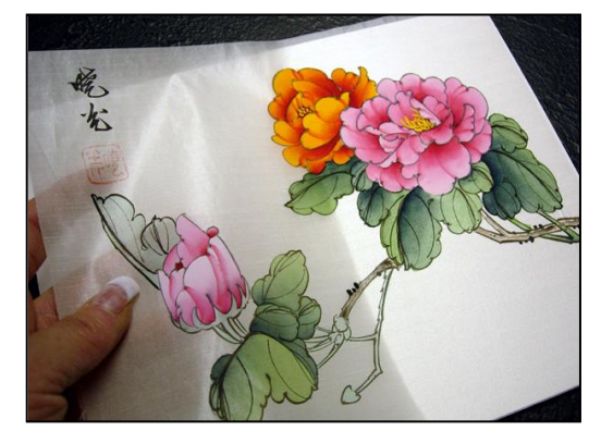
PHOTO 10 DRY MOUNTED SpeedMount was used for this sample, with only the right half of the silk having been mounted. It was bonded in a mechanical press of 155°F for 30 seconds and cooled under a weight.

Low end (and probably high end) paintings quite easily dry mount safely at lower temperatures. It may be more a matter of should it be mounted, rather than can it be mounted. The low temperature heat activated boards, like SpeedMount and Single Step Plus, nicely flatten and mount these silk paintings (photo 10) . SpeedMount was used for this particular sample, with only the right half of the silk having been mounted. It was bonded in a mechanical press of 155°F for 30 seconds and cooled under a weight. The reversible dry mount HA board Artcare Restore would also be a good choice.