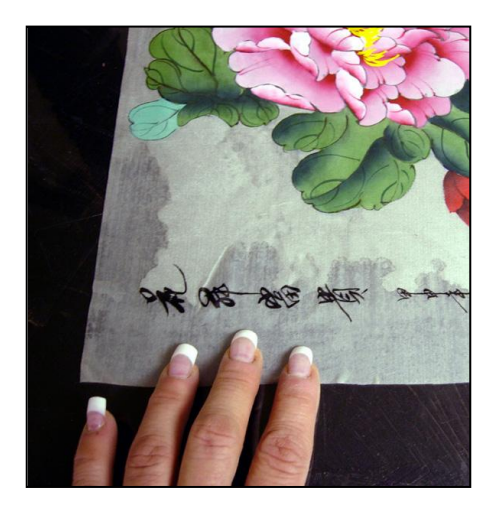
PHOTO 7 WET STRETCHED Lightly bump the wet silk at the outer edges with your fingertips to wet stretch. The dry upper portion of the painting will dry a different color and should also have been wet.

It is important when wet stretching a sheer piece of painted silk that the entire piece be soaked or the inner dry portion will dry lighter and with a different texture. This may have to do with the sizing in the silk or the inexpensive paints used for inexpensive paintings. You must also test all the colors to verify they are indeed waterfast and not likely to run or bleed.