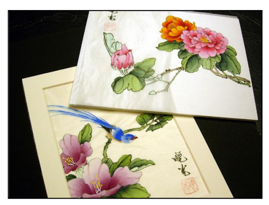
PHOTO 11 SUBSTRATE SELECTION The paintings are sheer, translucent, and will easily ghost any substrate color through to alter the color of the original painting. Both of these are antique white silk paintings that have been shifted to crème and white by the selection of the substrate.

Since HA low temperature boards are only available in white and black, color selection of a substrate to control color ghosting or bleeding is limited. The paintings are sheer, translucent, and will easily ghost any substrate color through to alter the color of the original painting (photo 11) . Selection of the adhesive will also impact the end color, so think first.