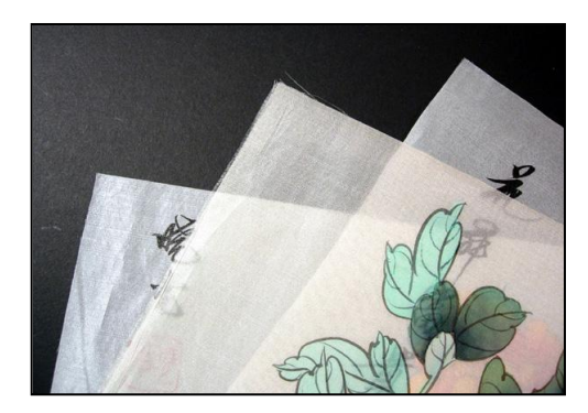
PHOTO 2 TYPES OF SILK Far left is a white, hard surfaced, shiny silk; center is an antique white, softer silk; far right is an antique white, non-glossy, hard surfaced silk that most resembles the feel of paper.

Inexpensive contemporary silk paintings are a dime a dozen these days for tourists. Though they feel and sound much like paper they are indeed silk fabric and not paper backed silk as is used in scroll mounting (refer to detail photo 4). The painted silks in photo 2 showcase three different commercial types. Far left is a white, hard surfaced, shiny silk; center is an antique white, softer fabric; far right is an antique white, nonglossy, hard surfaced silk that most resembles the feel of paper.