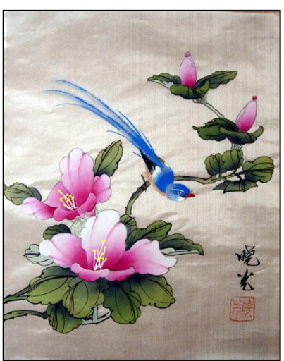
PHOTO 8 SHINY WITH NATURAL COCKLE The excessive shiny nature of the highly sized painting and very resistant to absorption resulting in cockling.

When paint is applied to sheer sized silk it will naturally lightly ripple or cockle as does western watercolor paper or thin rice paper, some silks worse than others (photo 8) . The excessive shiny nature of the highly sized painting makes it resistant to absorption resulting in cockling. Depending on the amount and consistency of paint and the silk itself, the painting will often appear cockled if placed hinged in a window mat with pressure at the edges (photo 9) . No amount of pressure at the edges of a window mat will ever hold down or smooth out the natural cockles created by dense opaque paint and sized silk.