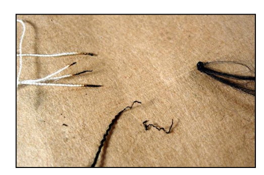
PHOTO 3 SILK FROM SYNTHETIC (L to R) Natural raw silk or silk blends will burn down the thread much like a candle wick leaving the burnt fiber. Linen burns down the thread but leaves a powdered ash where the thread was, and polyester silk will melt into a glob.