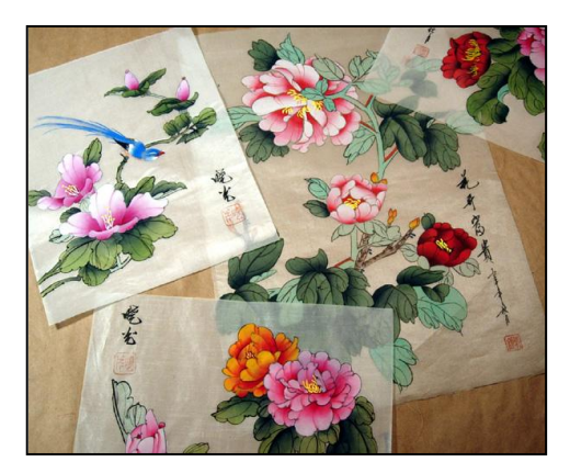
PHOTO 1 SAMPLER OF SILKS Hand painted silks are inexpensive collectibles available on the streets, in tourist shops, and at airports kiosks. Often priced between $5.00 - $10.00US they are very popular keepsakes from a trip to China.

Hand painted Chinese silk pictures may be inexpensive, unmounted, collectibles available on street corners, in tourist shops, and at airports kiosks. Often priced between $5.00 - $10.00USD they are very popular keepsakes from a trip to China (photo 1) . So on my latest trip to the Orient this past December I purchased a few small silk paintings for basic testing, handling abuse, and to help their determine framing tolerances, from a real world point of view.