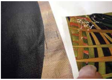
Inkjet giclée (left) canvas doesn't show cracking or flaking when worked, while mismatched inkjet materials often result in lesser quality with possible cracking, flaking, or damage when stretched (right).