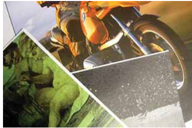
Dry toner laser prints are very susceptible to electrophotographic damage under heat (right).