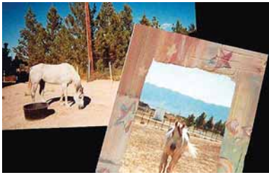
Borders as this one are common with these dye sublimation photos, which are heat and laminate safe.