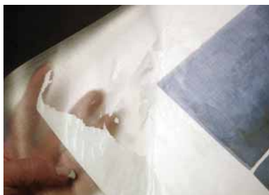
Dry toner was lifted from this print when the laminate was repositioned.