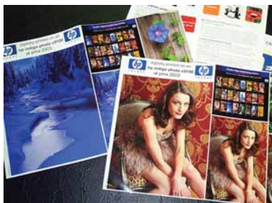
Electrophotographic Liquid toner Indigo photos are used by commercial labs for schools and advertising.