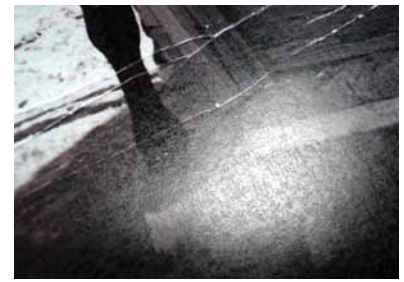
Sensitivity to heat and/or release paper silicone on an Eco-Solvent inkjet shows mottling of the ink surface.