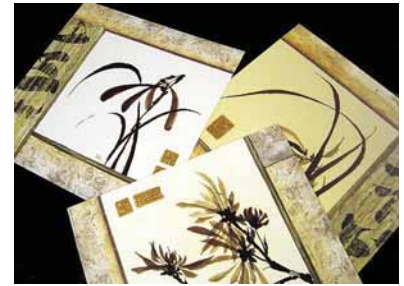
Heidelberg Electrophotographic offset digital press open edition prints are heat and laminate sensitive. Top left is the unmounted original; (bottom) mounted print shows mottled coloring in cream background; (right) print is yellowed by vinyl heat laminate.

Boards, and Drytac Media-Tac film create the strongest bond among pressure-sensitive products.