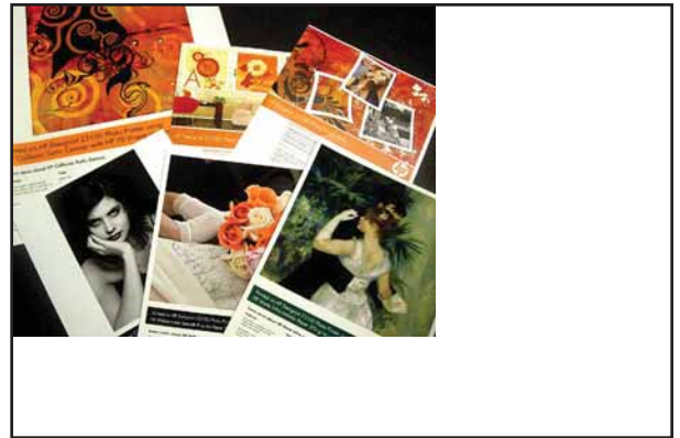
Thermal inkjet using pigment inks prints fine art and photographic media on HP Z series, Canon PROGRAF iPF series and others.

Epson wide format piezo printing currently dominates the in-studio and print-on-demand market for much fine art. This is not to say that other manufacturers do not print fine art giclée, it