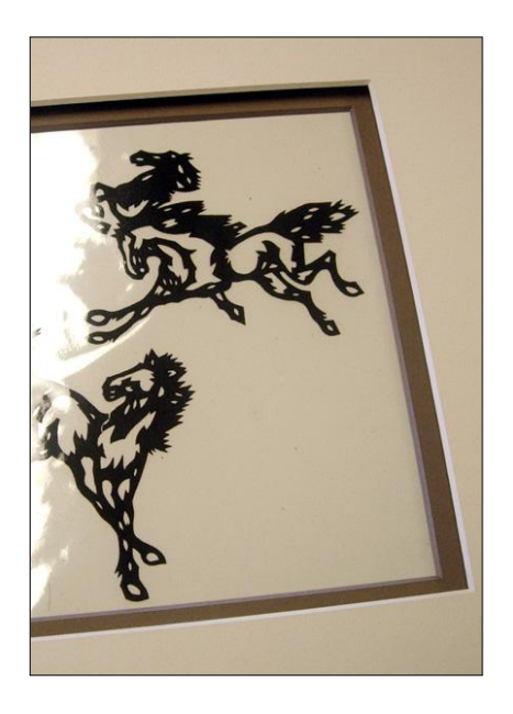
Photo 10 - Flat and Glaring The bottom and top mats are separated with a 1/8" spacer for additional depth, but even with the spacer this presentation seems flat. The polyester will always create some inner glare too as seen here.