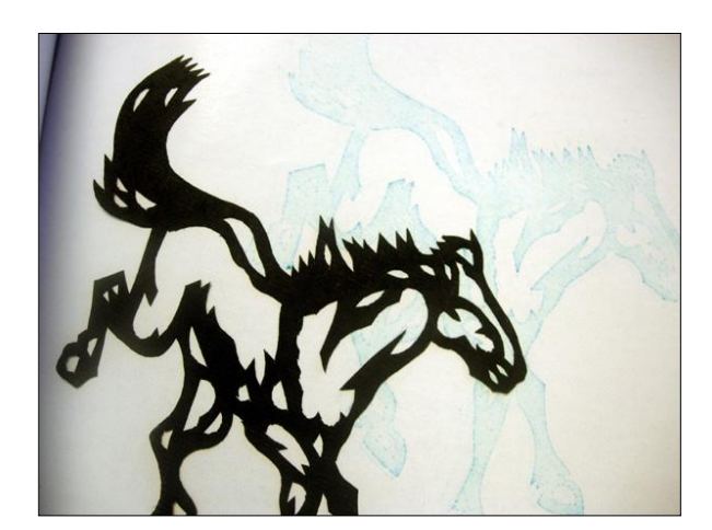
Photo 3 - Blue Ghost The black horse has ghosted itself to the white backing paper in the form of a blue duplicate image.

The small back horses have been cut from lightweight paper dyed black, which has ghosted its image to the support backing in the original package (photo 3) . This has nothing to do with UV rays or exposure to anything, just the nature of the dyes. Occasionally the cuttings are comprised of multiple layers (photo 4) . If attached together they should not be separated but rather encapsulated as one unit. If separate, they will require individual alignment within the frame. The fishbowl in photo 5 is being cut from a sheet of red paper. The pattern was stapled to the red paper then the image is delicately cut through both layers following the lines. When done, this layer will be placed with the previously cut fishbowl, sitting above it on the table, giving the bowl a more dimensional quality.