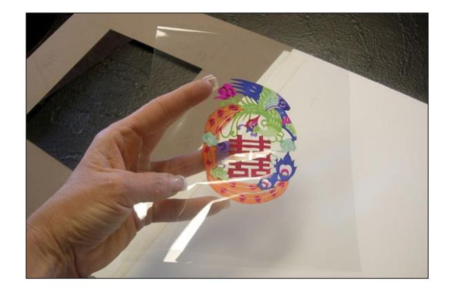
Photo 8 - Encapsulation Static electricity can be our friend holding an image suspended within two sheets of polyester film.

After the adhesive mist has been applied, let it sit until completely dry and no longer tacky to the touch. Place into position on mat board backing, cover with clean release paper, and press with a small tacking iron to reactivate the spray and hold it in place. Do not place in a cold vacuum frame, hot vacuum press, or mechanical press. Even the slightest shift of air during compression of the press can damage the delicate papercut.