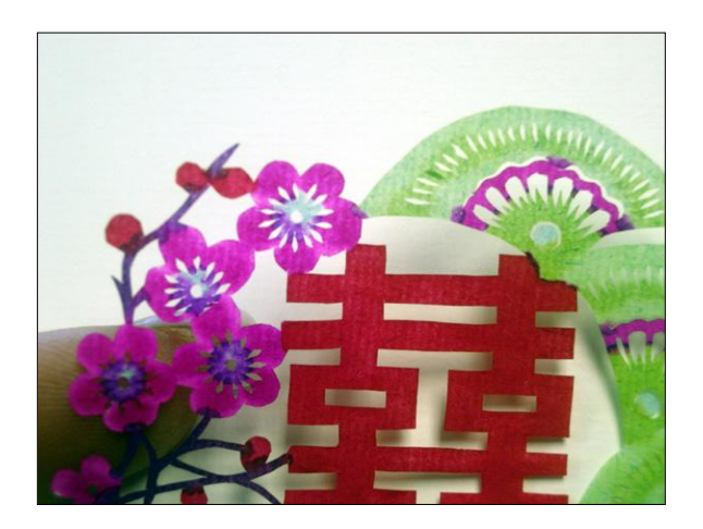
Photo 2 - Dyed to Add Color This cutting was originally white paper which was hand painted once completed. Notice the color gradations within the flower calyxes and the green of the fan.

The small back horses have been cut from lightweight paper dyed black, which has ghosted its image to the support backing in the original package (photo 3) . This has nothing to do with UV rays or exposure to anything, just the nature of the dyes. Occasionally the cuttings are comprised of multiple layers (photo 4) . If attached together they should not be separated but rather encapsulated as one unit. If separate, they will require individual alignment within the frame. The fishbowl in photo 5 is being cut from a sheet of red paper. The pattern was stapled to the red paper then the image is delicately cut through both layers following the lines. When done, this layer will be placed with the previously cut fishbowl, sitting above it on the table, giving the bowl a more dimensional quality.