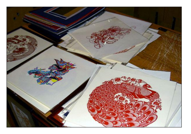
Photo 4 - Shapes and Colors The round phoenix measures 15" across out of a single sheet or red paper. The warrior in traditional dress to the left is a multi layered cutting in red, blue, yellow and black. Notice the pile of mats upper left ready to slap onto any purchased cut.