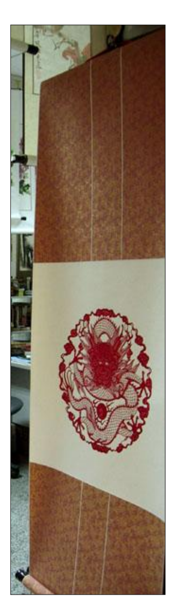
Photo 6 - Scroll Mounted The round dragon was traditionally scroll mounted to a heavier backing then a silk scroll. This is a common choice for display in Asia since scroll mounting is their framing.