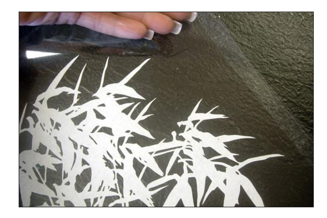
Photo 9 - Edges Sealed The polyester sheet edges should be sealed with two sided tape such as 3M #889, burnished firmly on a soft surface for maximum bond activation.