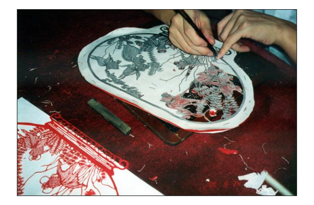
Photo 5 - Hand Cutting It will take the artist nearly a day to complete each layer for the multi-layered fishbowl in this photo. Cut with a pointed #11 X-Acto knife through two layers, the photo copy pattern and the red paper.