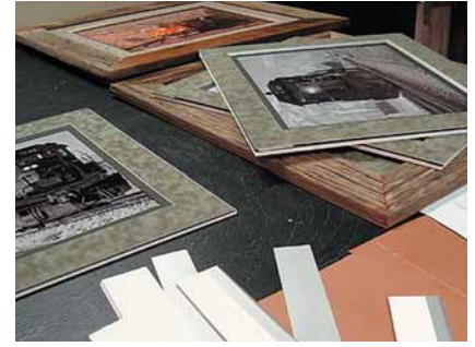
Photo 4: Four black-and-white and two color photos were mounted, with the mats cut and assembled, awaiting the frames.

chosen. Artcare Mist Suede #4196 was the perfect pale gray-green color to make the transition from the sand fence frame to each of the photos (Photo 1). Dusk Suede #4195 was a perfect match for the texture and colors of the sandy earth beneath the tracks and in the engine in his color images (Photo 2). Brushed Pewter and Antiqued Copper Precious Metal paper was selected to wrap 3/16" foam bevels as a visual spacer between the top and bottom mats, and all six photos used Bainbridge Black Shadow #8669 as liners (Photo 3). Though the wrap may seem incongruous with the earthy, barnwood-like nature of the photos, it really helped tie all the elements together.