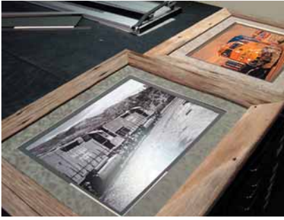
Photo 2: Mist Suede matting was used on black-and-white images while Dusk was perfect for the color photos.