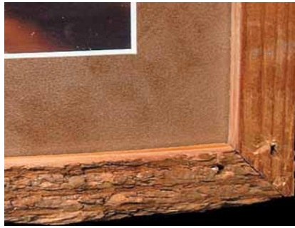
Photo 9: Narrower inner wood scraps and suede fall-outs were used to create smaller framed photos.