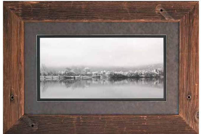
Photo 7: Drill holes and sun fading provide character for frames made from abandoned telephone pole cross arms from the desert.

Because of the wide nature of the frames, we had to increase the mat borders to 5" or narrow them to allow for a contrast between the mats and the frames. We opted for 3" borders for the liner mat and 2-1/4" for the suede top mat, making the outside dimensions 22"x26" plus 1/8" allowance. The wrapped bevel uses color to draw the eye inward from the outer frame to the color and metal of the engines, helping unify the design. Keeping the mats narrower also allowed the frames and photos to remain the dominant elements. Since the frames were being built to