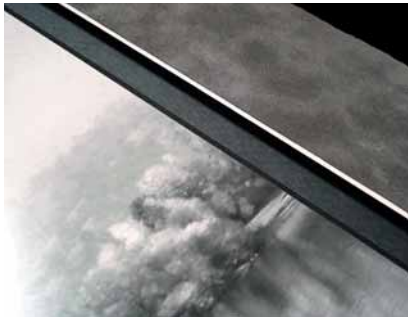
Photo 8: A spacer was used rather than wrapped bevel to add dimension.