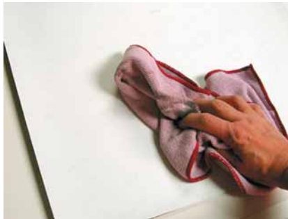
Photo 5: Microfiber cloths are perfect for removing dirt and dust prior to mounting photos. The back of image and the mount board both need to be wiped.

chosen. Artcare Mist Suede #4196 was the perfect pale gray-green color to make the transition from the sand fence frame to each of the photos (Photo 1). Dusk Suede #4195 was a perfect match for the texture and colors of the sandy earth beneath the tracks and in the engine in his color images (Photo 2). Brushed Pewter and Antiqued Copper Precious Metal paper was selected to wrap 3/16" foam bevels as a visual spacer between the top and bottom mats, and all six photos used Bainbridge Black Shadow #8669 as liners (Photo 3). Though the wrap may seem incongruous with the earthy, barnwood-like nature of the photos, it really helped tie all the elements together.