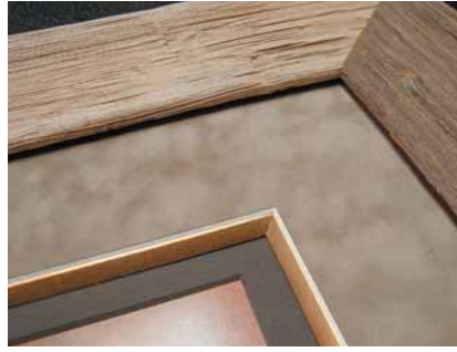
Photo 3: A sand fence frame was accented with Brushed Pewter and Copper Gold Precious Metal paper-wrapped 3/16" foam bevels as a visual spacer between the top and bottom mats.