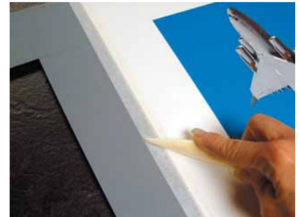
Photo 6: All assembled mat packages were book hinged along the long side to the mount board with the photo.