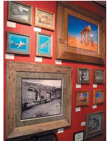
Photo 10: Photos were framed with wood from an old sand fence, telephone cross beams, and studio timbers.

black-and-white and dark photos like these, it is very important to prevent anything from being trapped beneath or imprinting into the mounting. All release materials were cleaned and wiped, and the mechanical press was also wiped and checked for residue. Both the mount board and the back of each individual photo needed to be wiped down with a clean microfiber rag to remove all particles and debris just prior to tacking for mounting (Photo 5). Preparing all photos at the same time may allow new paper dust to accumulate where not wanted.