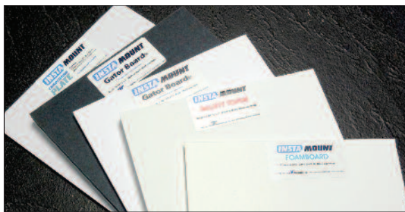
KoolTack Insta Mount on assorted substrates (top to bottom): competition plate (ACM), Gatorboard, Mighty Tough, and foamboards.

With the arrival of foamboards, higher roll adhesive mounting and laminating temperatures (205°F–225°F) threatened the stability of the core, which begins to melt at 225°F. As a result, both adhesive and over-laminates