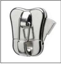
photo 10 The STAS Zipper and Zipper Pro (shown) security hangers lie flatter against the wall and are easy to install, squeeze to adjust, release to self-lock, as needed.

STAS J-Rail Max is designed for heavy paintings, professional displays and offers a range of security options. Rails are installed using preset countersunk holes about every 10 inches for flathead screws. Steel or aluminum Gallery Rods are used rather than cables. Hooks vary for required picture weight with small basic steel J-Hooks rated for 5kg/11lb to J-Security Hooks at 40kg/88lb. All slide onto the 4mm square rods and self-lock at desired heights ( photo 11 ). STAS is available from LION Framing Supplies, UK, STAS Picture Hanging, Picture Hanging Systems and Art Hanging Systems.