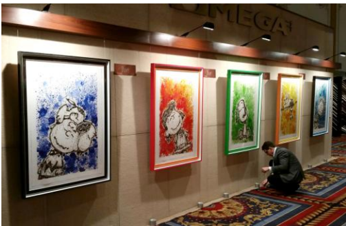
photo 6 The Omega Moulding booth featuring Takiya Hanging Systems at January 2015 WCAF.

Takiya Line pro TCW-01 medium weights are designed to stabilize hanging cables (photo 5) being placed at the bottom of the cable for ground level support to help to prevent art sway. These are from the Line pro series and are available for 30, 50, 70kg or 66, 110, or 150lbs. Displayed at the Omega booth during WCAF (photo 6) , clearly illustrating the bottom weighted two wire hanging solution for large art. Takiya Hanging Systems are safe & secure for hanging pictures available from Omega Moulding in USA and LION Framing Supplies, UK.