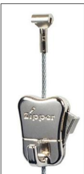
photo 9 The STAS Zipper on STAS Cobra cable will support 15kg/33bs, are easy to install and adjust as needed. Perlon and Zipper only supports 10kg/22lbs.

STAS Cobra is a unique patented suspender (wire) that can be placed directly in the Cliprail Max and is available as perlon nylon cord or Cobra steel cable available in white or black. STAS Cobra suspenders have a specially shaped metal head locked onto the end of the cable which hooks and locks into any STAS rail. There are a number of Cobra hooks and cords are for loads of 8lbs, 22lbs, 33lbs and 44lbs. The perlon plus Zipper hanger is not as strong rated at 10kg/22lbs while steel plus Zipper is rated at 15kg/33lbs per hook ( photo 9 ). The Zippers are easy to install, squeeze to adjust, and release to self-lock. It is a flat shape which allows the frame to hang closer to wall. The patented STAS Zipper pro is equipped with an extra theft-delaying bracket which also helps hold art if bumped or during earthquakes ( photo 10 ).