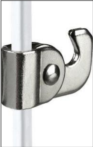
photo 11 STAS J-Rail hooks slide onto 4mm square rods that self-lock at desired heights. Basic steel J-Hooks are rated for 5kg/11lb.

STAS J-Rail Max is designed for heavy paintings, professional displays and offers a range of security options. Rails are installed using preset countersunk holes about every 10 inches for flathead screws. Steel or aluminum Gallery Rods are used rather than cables. Hooks vary for required picture weight with small basic steel J-Hooks rated for 5kg/11lb to J-Security Hooks at 40kg/88lb. All slide onto the 4mm square rods and self-lock at desired heights ( photo 11 ). STAS is available from LION Framing Supplies, UK, STAS Picture Hanging, Picture Hanging Systems and Art Hanging Systems.