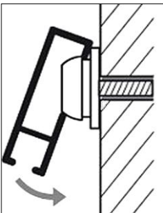
photo 8 The aluminum STAS Cliprail snaps onto buttons screwed into the wall which will support 25kg/55lbs per meter.

The patented STAS Minirail wall system is the thinnest picture hanging system, with its 16mm wide rail available in white or aluminum. The STAS Cliprail Pro is a heavier rail which is a suspension system for ceilings rated at 45kg/99lbs, and uses the STAS Cliprail clip and is rated at 25kg/55lbs per meter. The aluminum STAS Cliprail snaps onto buttons screwed into the wall which will support 25kg/55lbs per meter ( photo 8 ).