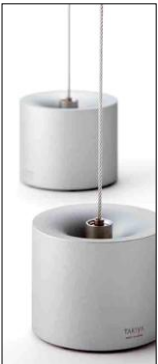
photo 5 Takiya Line Pro medium weights are designed to stabilize their hanging cables to prevent art sway.

Takiya Line pro TCW-01 medium weights are designed to stabilize hanging cables (photo 5) being placed at the bottom of the cable for ground level support to help to prevent art sway. These are from the Line pro series and are available for 30, 50, 70kg or 66, 110, or 150lbs. Displayed at the Omega booth during WCAF (photo 6) , clearly illustrating the bottom weighted two wire hanging solution for large art. Takiya Hanging Systems are safe & secure for hanging pictures available from Omega Moulding in USA and LION Framing Supplies, UK.