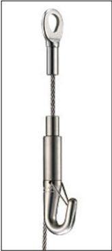
photo 4 Takiya MuSE safety hooks on heavy steel wire.

Cable wires are available as 1.2mm and 1.5mm gauge steel wire nylon coated clear, gray, yellow, blue and brown to blend with assorted wall colors. Heavier 2.5mm cables will handle loads up to 150lbs. As with any wire and hangers it is advised that two cables be used for valuable or heavy items, and that each should have a load capacity higher than the weight of the frame (photo 4) .