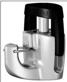
photo 7 Newly Squeeze Adjustable Hook H100S has a security clip and is rated at 20kg/44 lbs. Squeeze down on the top, slide to locate and release to lock in place.

Newly has a wide assortment of variations including squeeze adjustable, self-locking, screw-locking, solo hangers, and sloping stoppers. Push the top of the hook down to slide, then release to firmly relock in place ( photo 7 ). Twister suspenders and Squeeze hooks are rated at 20kg and the lightweight Screw hooks are only 5kg/11lbs. Cables are available as perlon--two synthetic polyamide fibers similar to nylon--translucent steel cable, silver steel rod, and white. Available from LION, UK