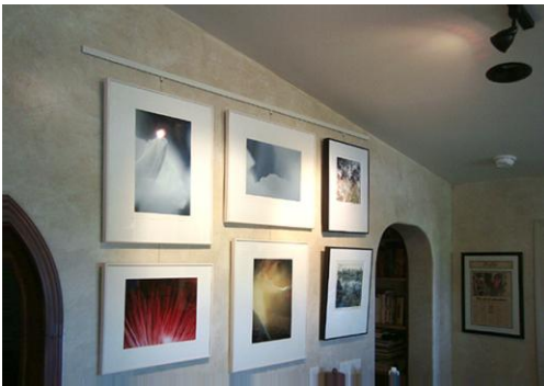
photo 1 Multiple pieces of art are hung from single or double wires, not to exceed weight limitations. These are single wires. Customer opted for a horizontal rail rather than cathedral rail placement.

All system parts will have a manufacturer calibrated rating for 3x that of a frame. If a rail, cable or hook lists at a weight limit of 100 lbs, it will most likely hold 300 lbs. If multiple frames are to be hung on the same wire then all must add up to less than the weight rating. (photo 1) Takiya heavy duty rails will support up to 150 lbs maximum art weight. Medium weight rails will hold between 65-110 lbs and lightweight rails support up to 33 lbs. Check with manufacturer weight recommendations when selecting a system.