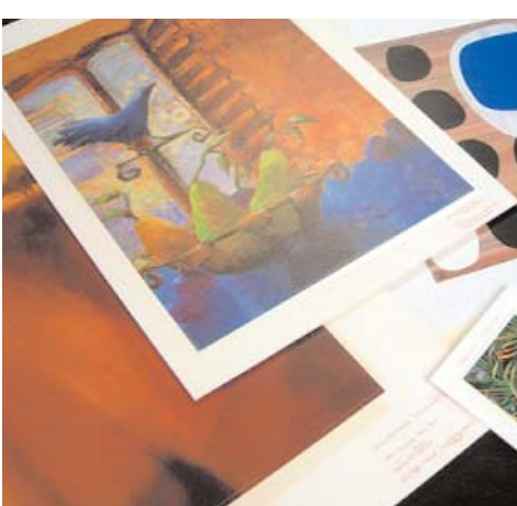
Open edition digital canvases can be printed using a Heidelberg press, which incorporates color laser technology and piezo pigmented-ink printing in a wide-format machine.

Fuji has launched a version of the traditional Cibachrome as FujiFlex, a digital image printed on polyester film with much of the look of a traditional Cibachrome. FujiFlex film is a bit thinner than Ilfochrome Classic polyester film and has a bit of a pearl sheen to the back. Fuji also offers FujiFlex as an RC version in both matte and gloss finish. These may be static mounted just like traditional Cibachromes.