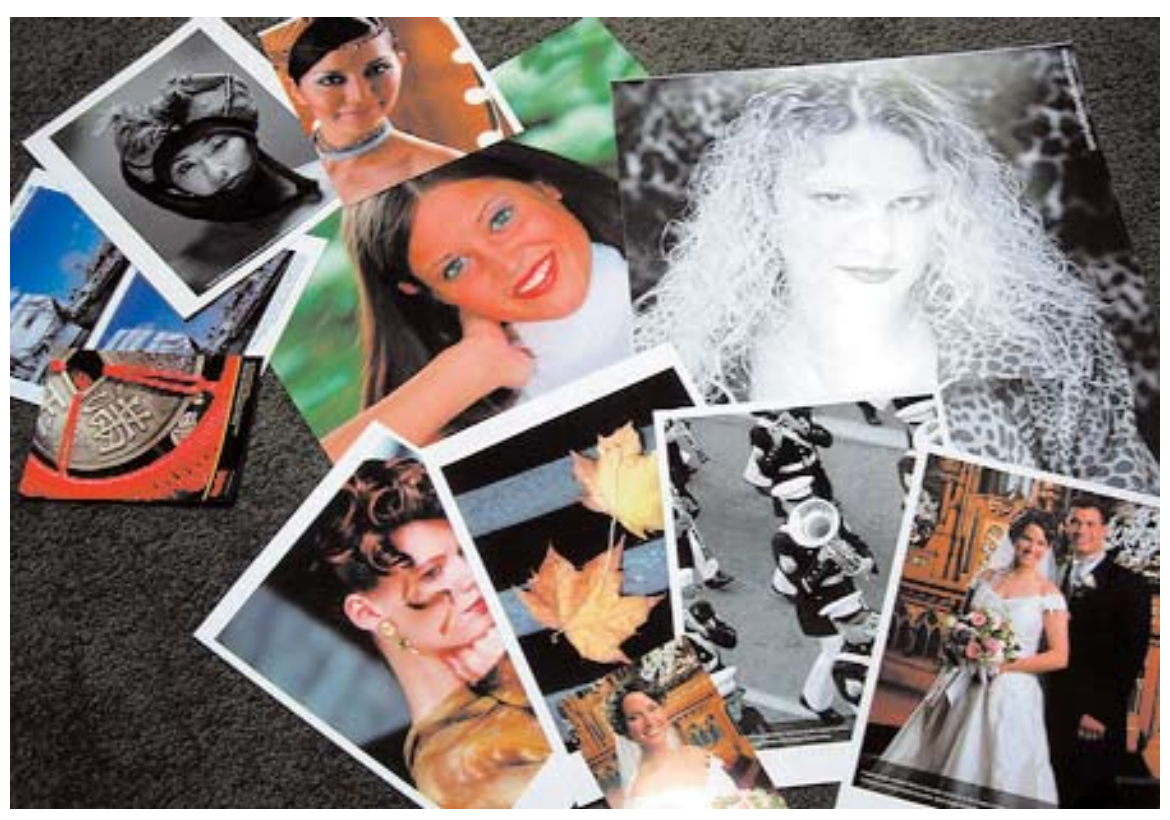
Common Digital Photos include (upper left) thermal transfer/dye sublimation photos, (center) wide format inkjet photos, and (front/lower right) RA-4 photos.