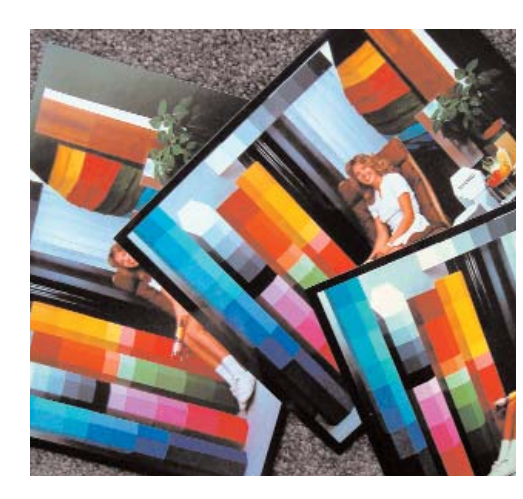
Ilfochrome Classic prints include (left to right): Cibachrome RC Glass; and Ilfochrome Classic.