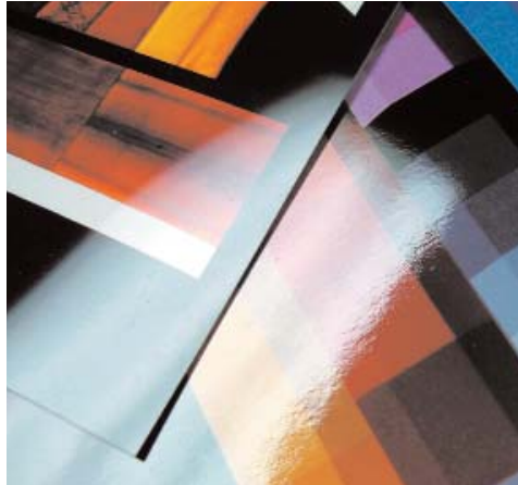
There is a highgloss, glass-like surface on llfochrome Classic polyester film image (left), while Cibachrome RC has a slight paper texture (right), setting them apart.

Magiclée Verona fine art papers are compatible with either dye or pigment thermal or piezo printers like Canon iPF series, HP Zseries, Encad, and Epson.